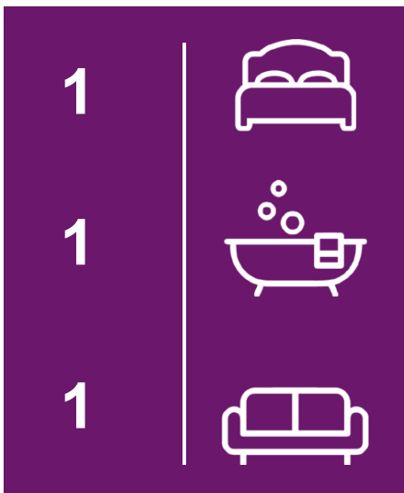
Illustration for identification purposes only, measurements are approximate.

Approximate Gross Internal Area 492 sq ft / 45.7 sq m